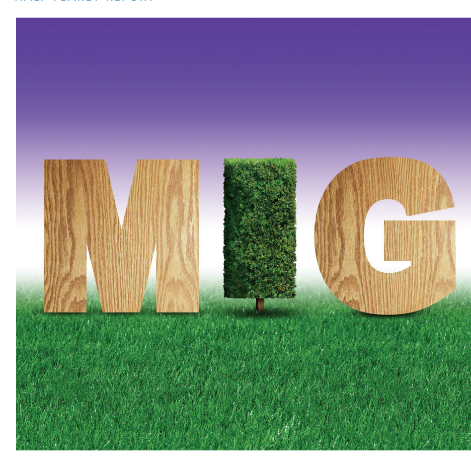
Unaudited Half-Yearly Report for the six months ended 31 July 2008