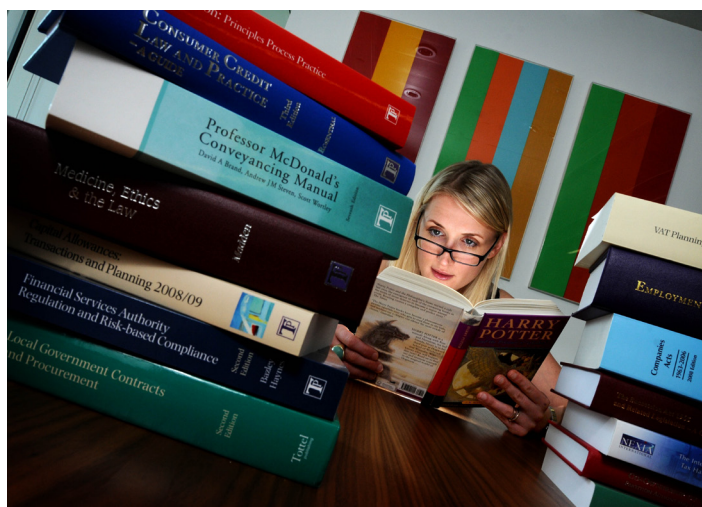
"Tottel Publishing meets Harry Potter"

The 'O' Share Fund's original investment cost of £514,800 had already been reduced to £325,182 in March of this year when Tottel repaid 50% of the Company's loan stock investment.