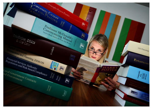
"Tottel Publishing meets Harry Potter"

The Company's original investment cost of £235,200 had already been reduced to £148,568 in March of this year when Tottel repaid 50% of the Company's loan stock investment.